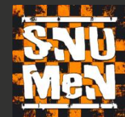
SNU:MeN (LP) – 2017