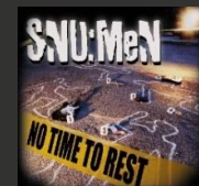
No time to rest (LP) – 2014